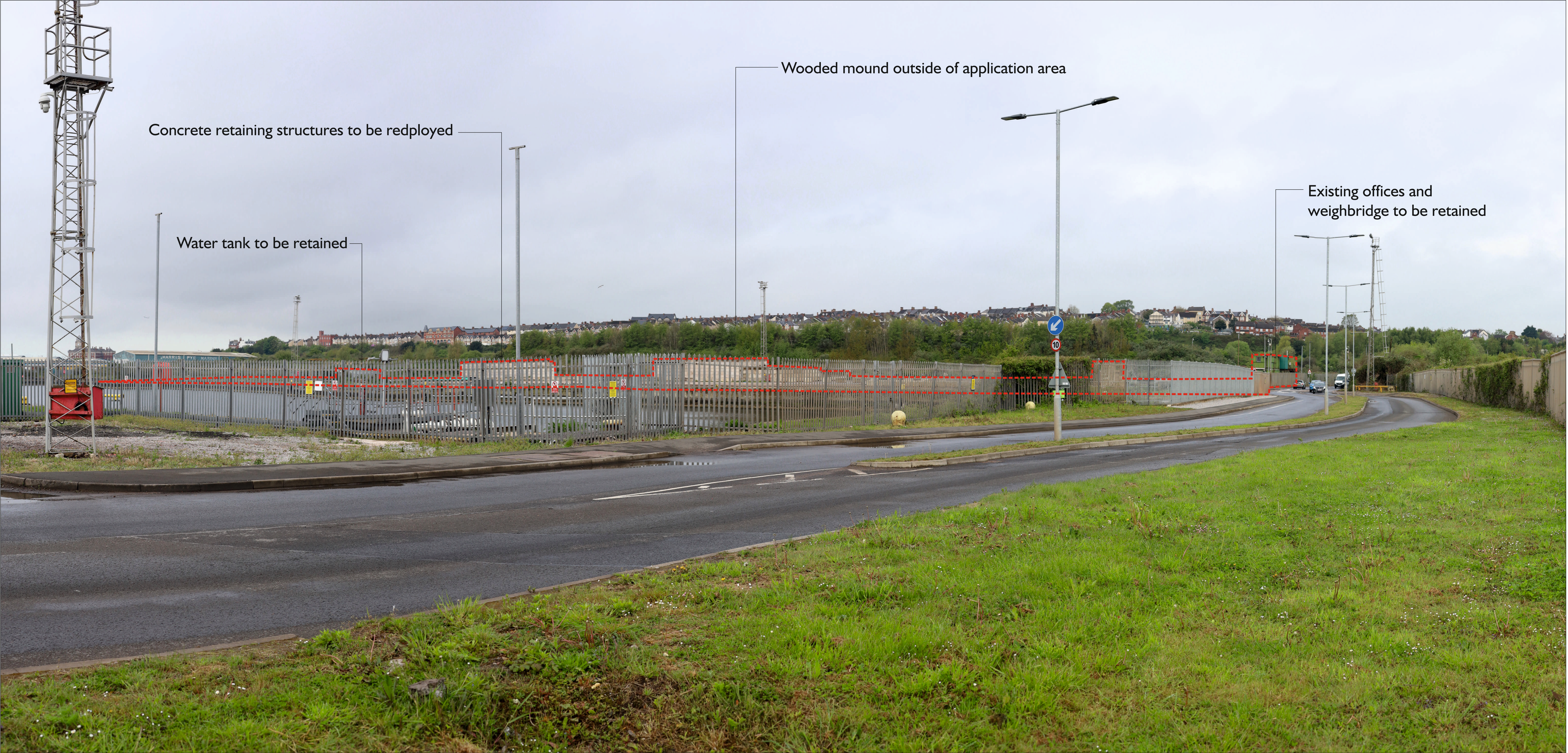
Representative Viewpoint 6 - Looking northwest from Wimborne Rd on the south side of Number 2 dock